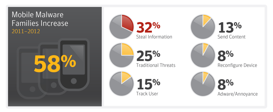
Mobile malware continues to grow. Source: Symantec Internet Security Threat Report 2013

Employees increasingly rely on smartphones and tablets, both personally owned and company issued, to achieve higher levels of productivity. However, these productivity gains have also expanded the threat landscape, as mobile devices have become a new target for cyber attacks. These devices are less secure than traditional endpoints and many commercial app stores, particularly those for open mobile operating systems (such as Android™), cannot enforce universal app screening. As a result, the mobile devices employees rely on more and more are becoming vulnerability points that attackers can exploit.